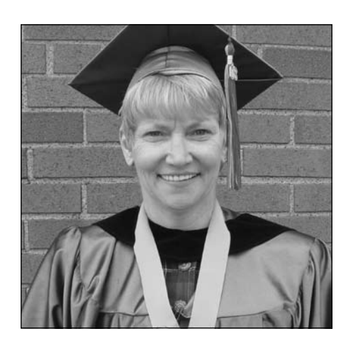
"Going back to school was a very good thing."