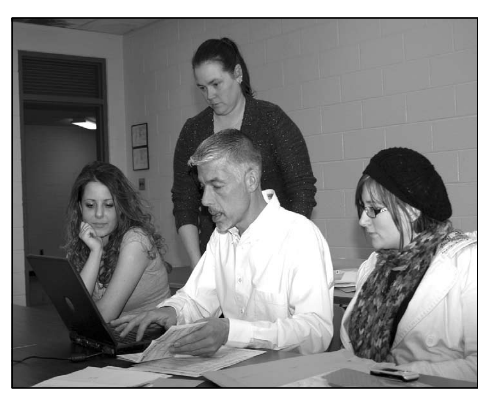
Accounting students work on a group project for class.

Financial aid is NOT automatically renewed each year. Students must reapply each year to be considered for financial assistance.