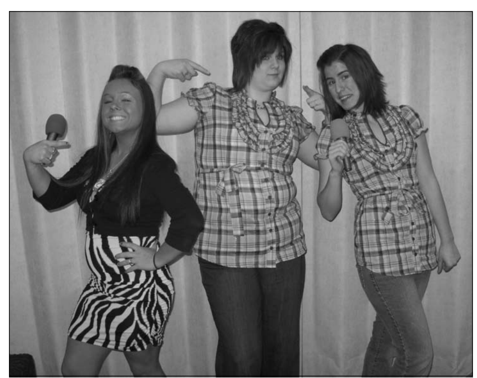
The top JCC Idol contestants strike a pose before the finale.