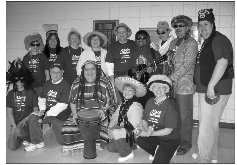
During the annual Math Quest, the "LCD" Least Common Denominator Band performs.

The AS program has been designed as parallel curricula to those of universities. These include transfer to programs in chemistry, geology, mathematics, and physics. A student may also pursue engineering technology and industrial technology fields at the baccalaureate level.