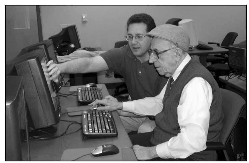
The Pugliese Training Center provides state-of-the-art facilities for classes and workshops.

Courses include credit classes for the academic programs and credit classes for continuing education certificates. Tuition and fees follow the guidelines of credit and noncredit courses.