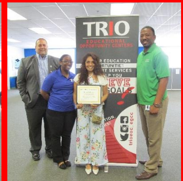
TRIO EOC Awards Participant Academic Achievements with TRIO Certificates & Lapel Pins