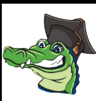
Summer Pace AA in Teacher Education