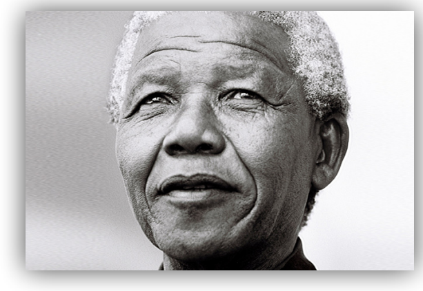
"Education is the most powerful weapon which you can use to change the world." ~ Nelson Mandela